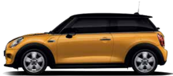
MINI 3-DOOR HATCH.