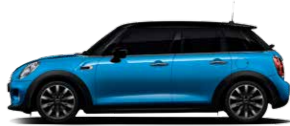
MINI 5-DOOR HATCH.